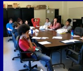
Hard at Work...